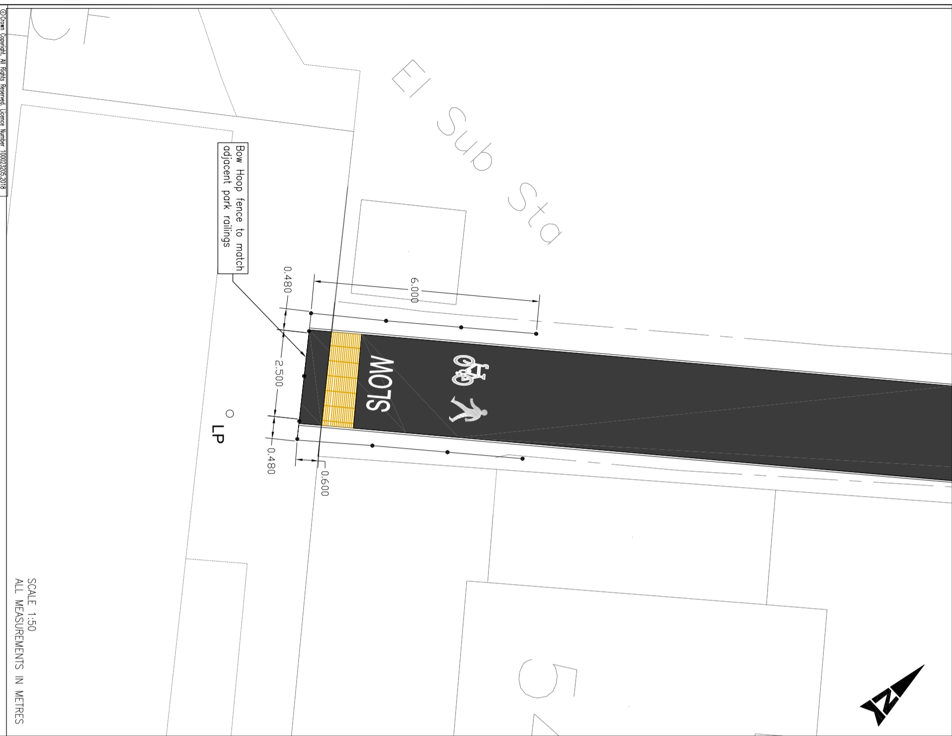
SCALE 1:50 ALL MEASUREMENTS IN METRES